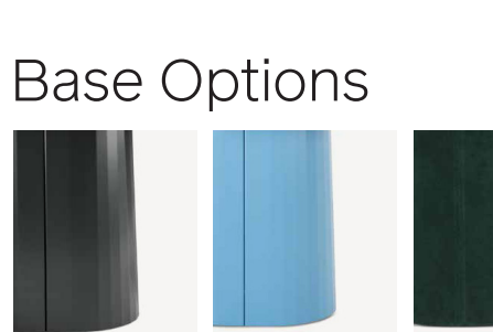
RAL powder NaughtOne colours

Tun 920 Coffee Table Steel Base ANSI/BIFMA x5.5 (2021) Static Load 125 lb