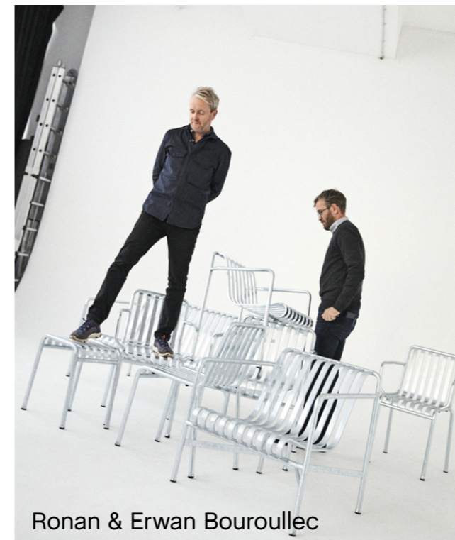
Ronan & Erwan Bouroullec

Ronan & Erwan Bouroullec the Paris based design brothers from Brittany have been working together since 1998. Ronan is a graduate of the École supérieure des Arts décoratifs in Paris and Erwan attended the École nationale supérieure des Arts in Cergy before starting their own studio.